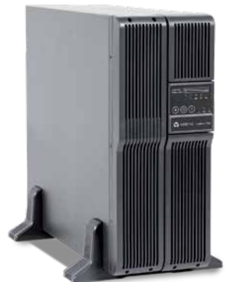
Liebert PSI XR 2U Tower version