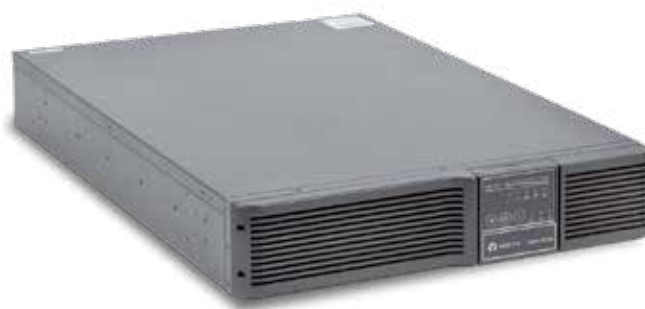
Liebert PSI XR 2U Rack version