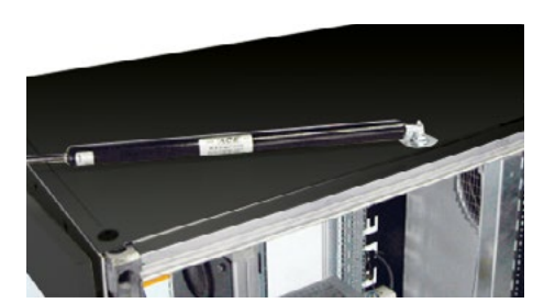
Automatic emergency door opening option for server rack